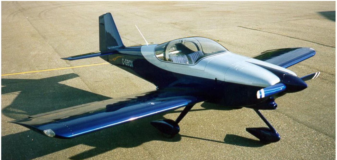
Homer Rogers's beautiful RV-6A (C-GBQX) was the aircraft used to test the Sensenich 72FM propeller. See the December WCRVator for a report.