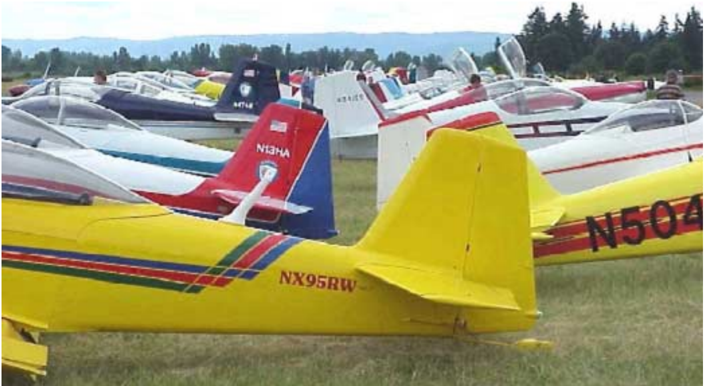
Van's Air Force Home Wing recently held their 8th annual Norhtwest RV Fly-in, at Scappoose, OR. More than 80 RVs showed up, and the Blackjack Squadron entertained the croud. Keep building, this will be you one day.

Newsletter of Van's Air Force—Western Canada Wing http://ourworld.compuserve.com/homepages/tedd/wing.html