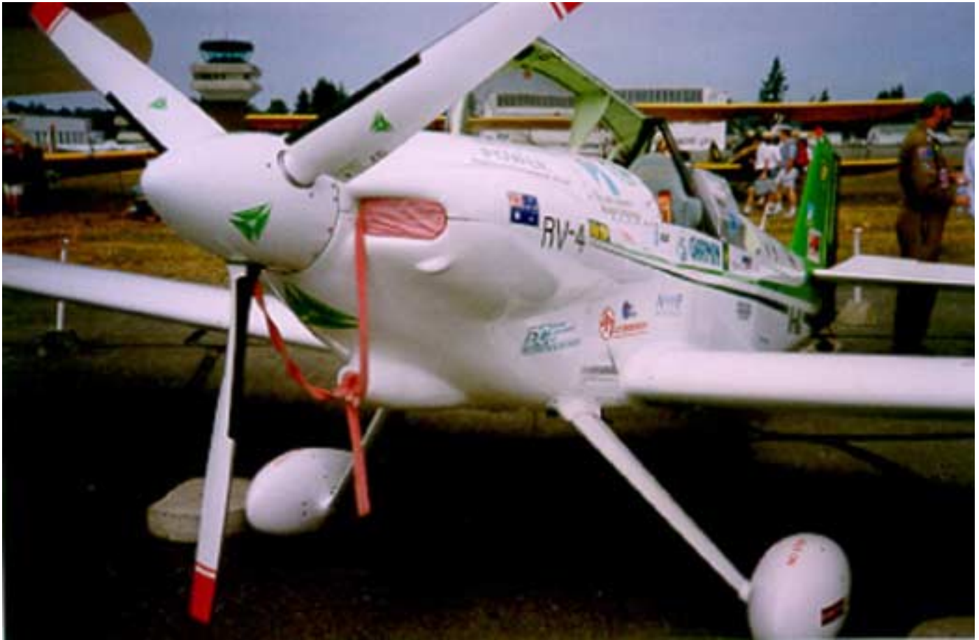
VH-NOJ from the front, showing the MT CS prop. Jon's in the background, talking to some interested spectators.

Newsletter of Van's Air Force—Western Canada Wing