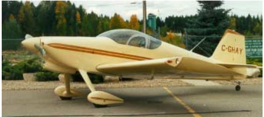
Eustace Bowhay's RV-6, which is well-known among RVers as the first RV to be put on floats.

I had my engine overhauled in 1996, and decided to give the Bendix Fuel Injection a try—a system I was familiar with. This is a big change, requiring a change in both the engine driven pump and the boost pump, because of the higher pressure and the extra plumbing required. This was another reason for moving the gascolator into the wing root (so that the gascolator would not be pressurized). I mounted the Weldon pump on the fuselage side of the firewall above the